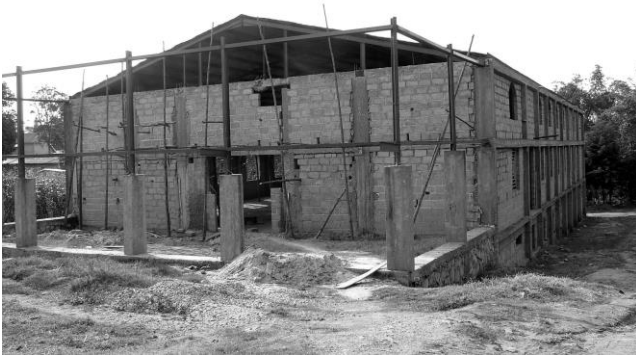
Construction of new church building.