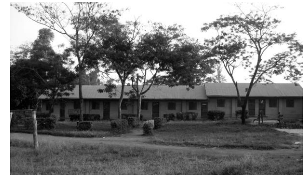
Man School Building

classroom space and other resources but to help we are nearing the completion of a Nursery building, the next stage will be plastering the interior and exterior walls. The outside of the main building has been plastered, the staff quarters are now completed and we are about to commence constructing a new kitchen. We still need to erect a perimeter fence to secure the whole site.