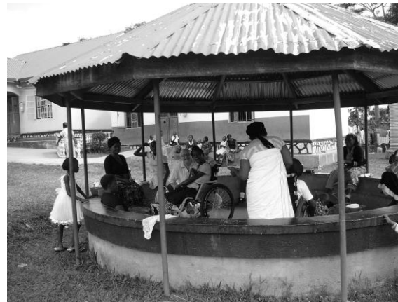
Outside Sun Shelter.

I am pleased to say that Uganda Ministries has been able to provide regular financial support to help with construction costs and provide staff salaries, equipment and basic food for those cared for at the centre.