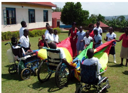
Some of the residents playing a game.