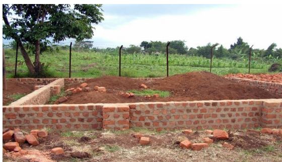
Foundations for the new classrooms.

During our stay we visited the Hidden Treasures Primary School in Kiyoola, a very poor village not far from Lake Victoria. The school was built ten years ago and since then has grown rapidly. We currently have 245 registered pupils and naturally this puts a strain on class-room space. In January the Education Authority Inspectors said we needed to build a further two classrooms at a cost of £5,500. In faith we have begun to construct these and we hope we can complete this necessary work soon.