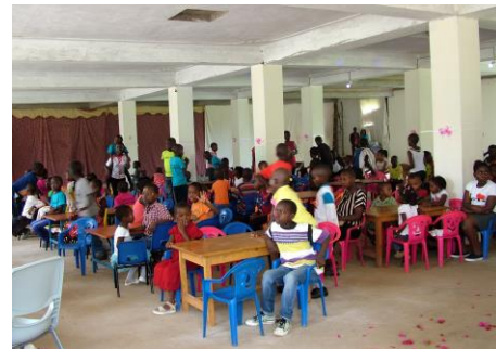
Children's Ministry room